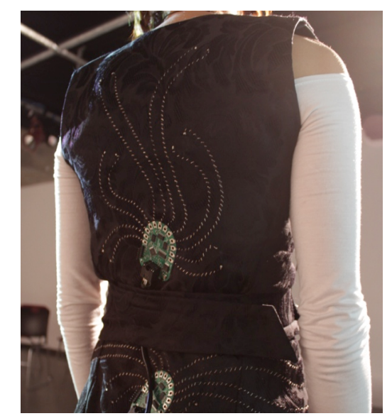
Figure 3 The back zone and the belt zone. The vibrotactile elements lie underneath the area between two connector endings emanating from each of the central boards.

From the the start, therefore, we aimed at integrating the technological elements of the suit (motherboards, vibrotactile elements, cables etc.) into the textile design – for example, all vibrotactile elements were sewn into the suit, connections inside the suit were stitched – and look like embroidery.