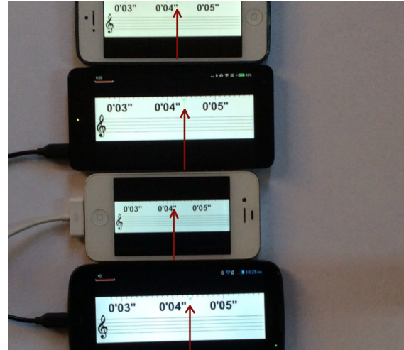
Figure 2. Time differences between several devices were measured with snapshot pictures.